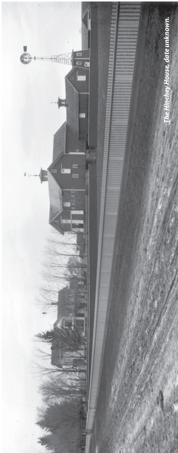
The Hinchey House, date unknown.